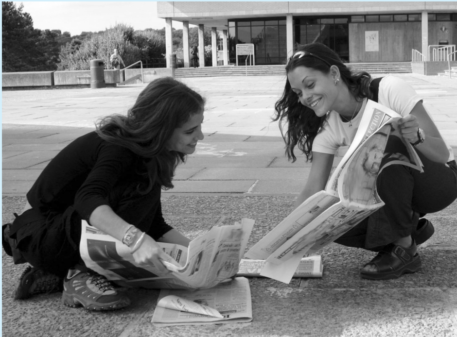
The first generation to have a daily newspaper in Welsh.